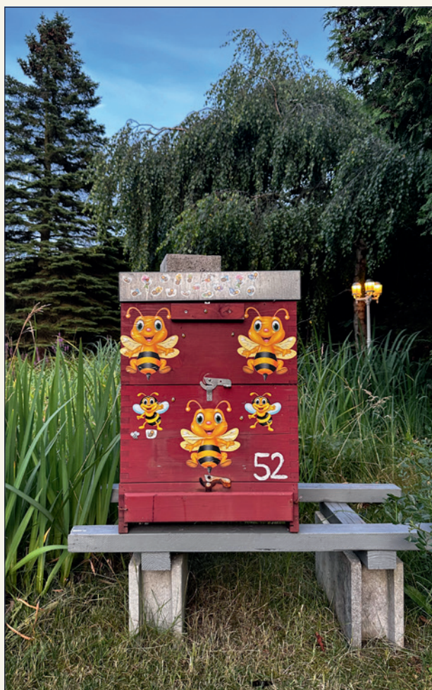
A beehive (where the bees live)

It might be worth asking your neighbours what their views on beekeeping are. You might love bees, but your neighbours might not, and you don't want them complaining they were stung by one of your fuzzy friends. With any luck, your neighbours will be thrilled with the idea of beekeeping, as they will be aware of the numerous benefits; but some might be allergic to bees, so it is probably best to make sure everyone who lives near you is okay with living next to bees. Remember that someone can become allergic to bees later on in life, so it is a great idea to have some EpiPens ready to use in case you or someone else gets stung and has a reaction.