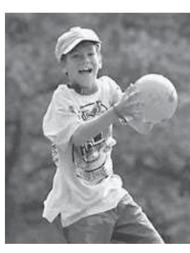
3. What ... Jason ....? He .... (to play with a ball).