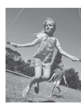
4. What ... Joanna ...? She ... (to skip with a skipping rope).