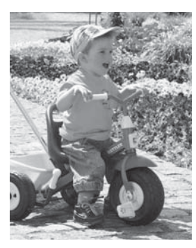
1. Example: Look, what is Alex doing? He is riding a tricycle.

A Look at these pictures and say what the children are doing. Remember that you must use the Present Continuous form of the verb when you describe pictures.