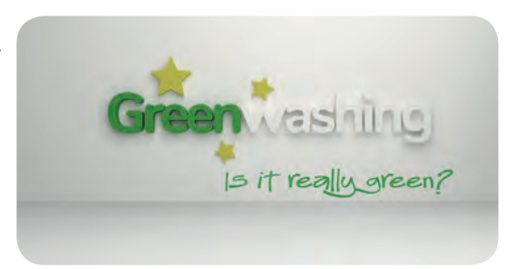
( Writing reference, p. 259)

Give your blog entry a title. Write about 250 words.