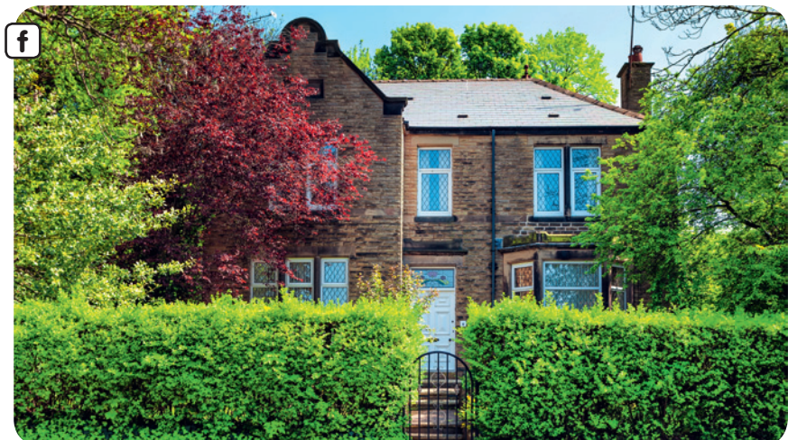
The Caines' castle