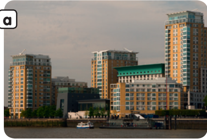
Living in London Docklands