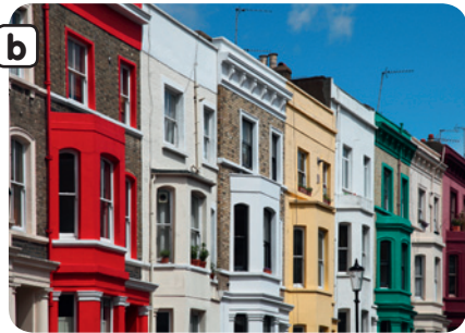
Notting Hill, London