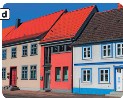
An old street, new colours