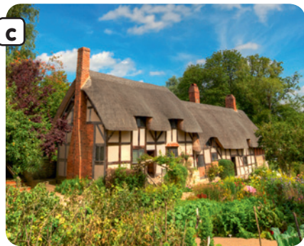
Where Anne Hathaway lived (the wife of William Shakespeare)