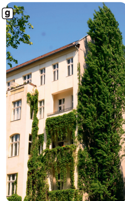
Old building, new facade